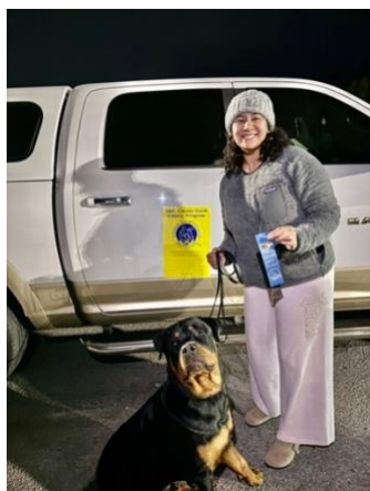
Tito and Scar

Congratulations to these dogs and handlers who earned their CGC titles. Well done all!